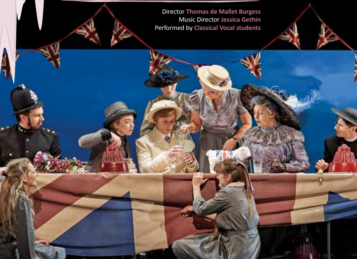
Albert Herring 2016

Bookings open Friends 18 July Public 25 July