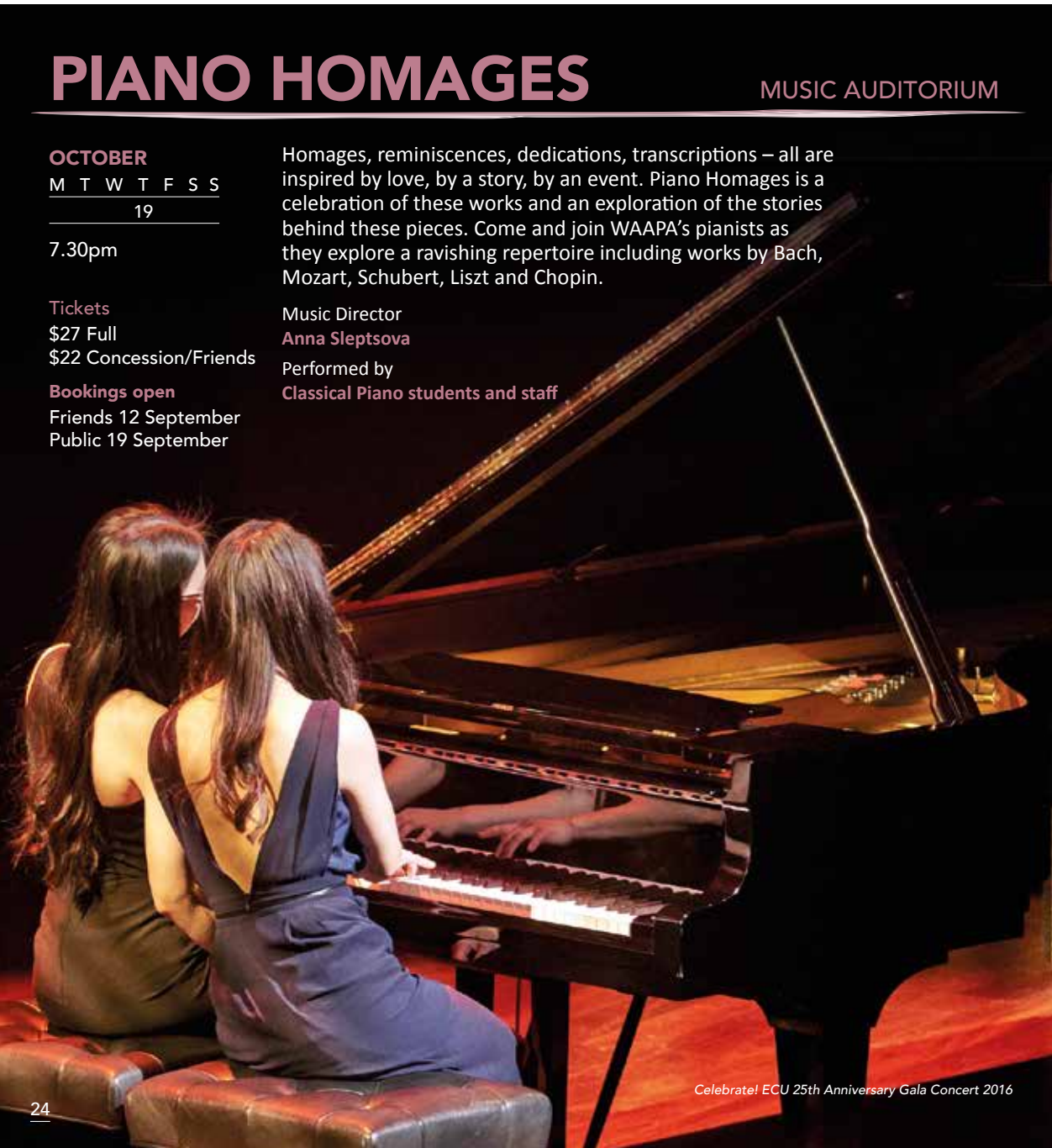
Celebrate! ECU 25th Anniversary Gala Concert 2016