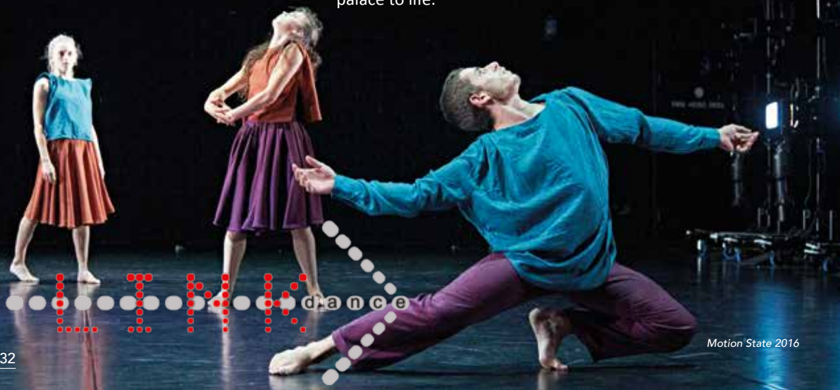
Motion State 2016